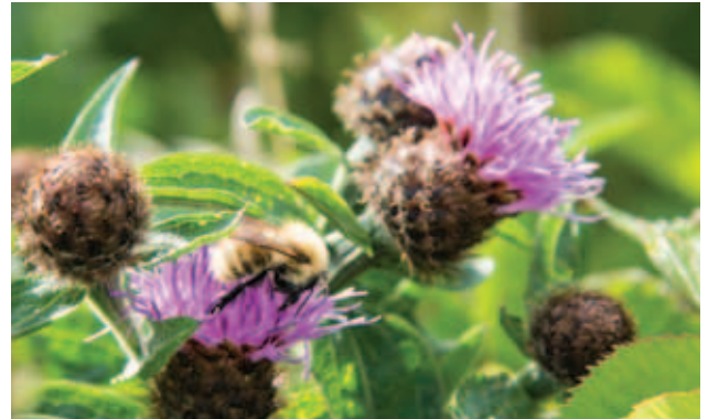
Common carder bumblebee, Croy Hill

Although the Antonine Wall WHS runs through the highly urbanised and industrialised central belt of Scotland, large areas of it still remain in rural or non urban settings. These areas may include protected habitats or species, important geological sites, or sites with natural heritage designations as well as cultural heritage designations. Balancing the needs of both can sometimes prove challenging for Partners and stakeholders. Land management regimes, for example, that benefit the cultural heritage and landscape, may not meet biodiversity needs, and could even be harmful for certain species or habitats. Similarly, managing the impact of nature on the archaeological resource, in terms of land use/maintenance and animal activity, poses specific pressures at different areas of the Site. Agricultural activity such as ploughing or stock control issues may require discussion on land management approaches.