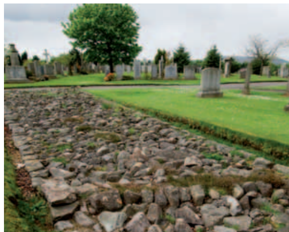
The base of the Antonine Wall visible in New Kilpatrick Cemetery