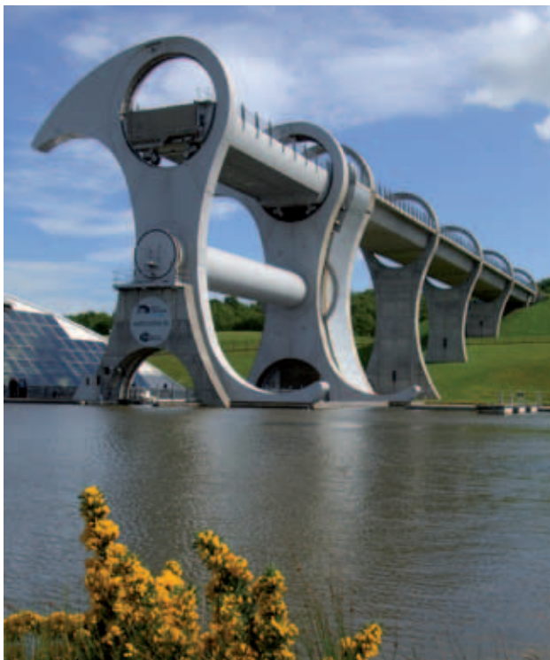
The proximity of the Falkirk Wheel to the Antonine Wall at Rough Castle offers joint tourism and marketing opportunities

To encourage wider community engagement and participation with collections and intangible heritage related to the Antonine Wall