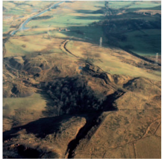
The Antonine Wall across Croy Hill

5.16 Effective co-ordination also enables delivery of much of the day-to-day requirements as set out by UNESCO: these include producing action plans, monitoring reports and further versions of the Management Plan, all of which amount to significant amounts of work, especially for a site of the nature of the Antonine Wall.