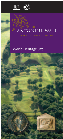
Promotional leaflet using new branding

The Antonine Wall branding will be consistently used by all Partners and Stakeholders for relevant projects