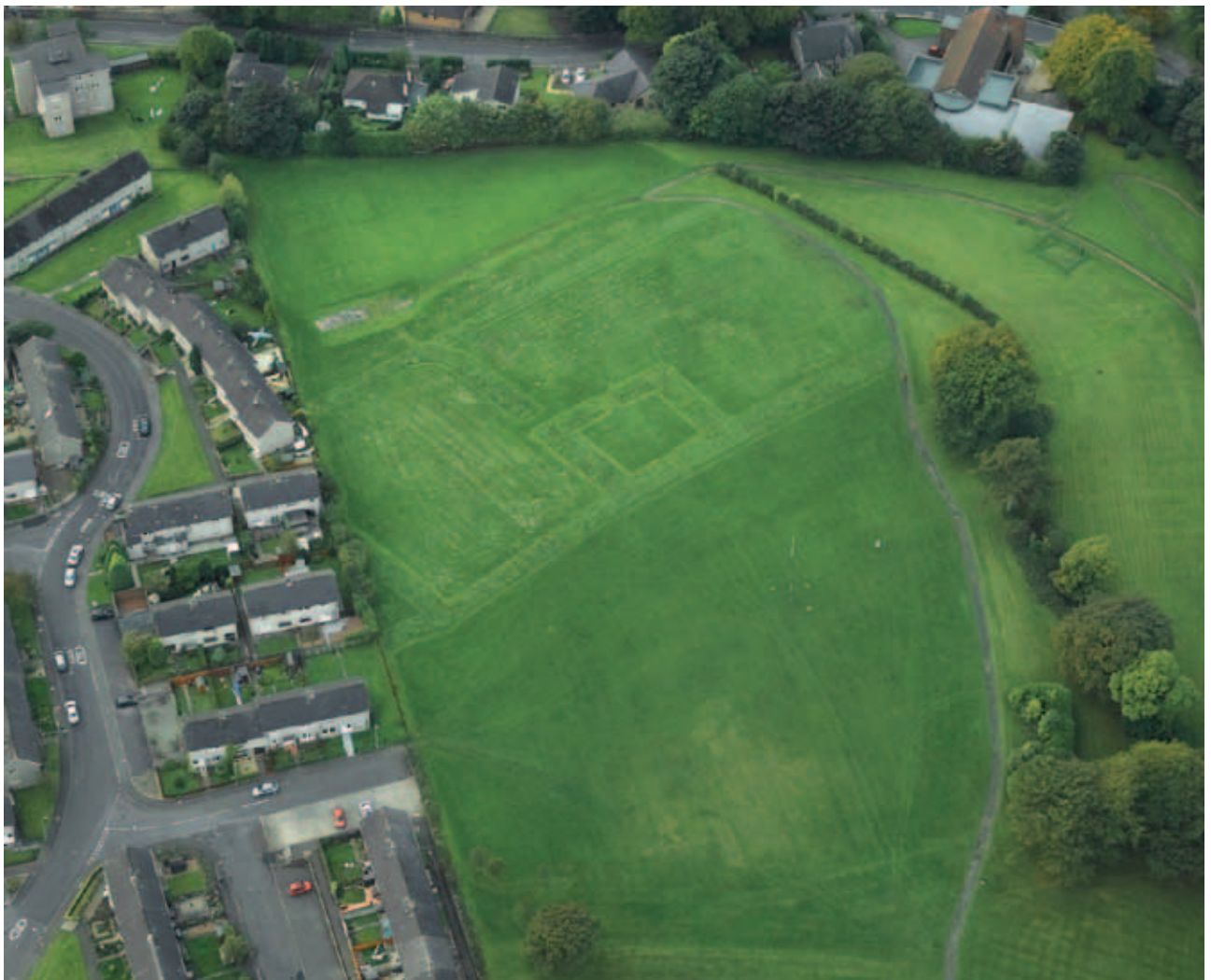
Grass management to reveal Duntocher Fort, Golden Hill Park