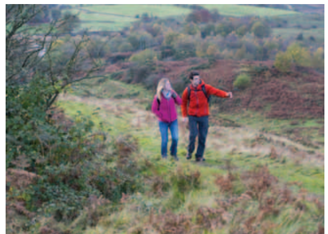
The Antonine Wall is a popular long distance walking route

To develop and foster links and partnerships with local tourism providers and other businesses, to provide an enhanced visitor experience and develop collaborative business opportunities