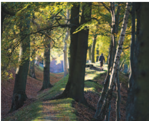
Autumn at Watling Lodge