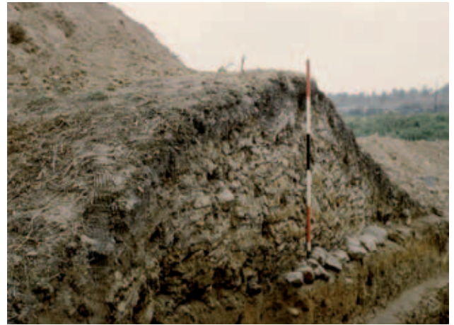
1959 Excavations at Tentfield Plantation

Opportunities for international collaboration will be sought, to link wider Roman frontier studies and the Antonine Wall