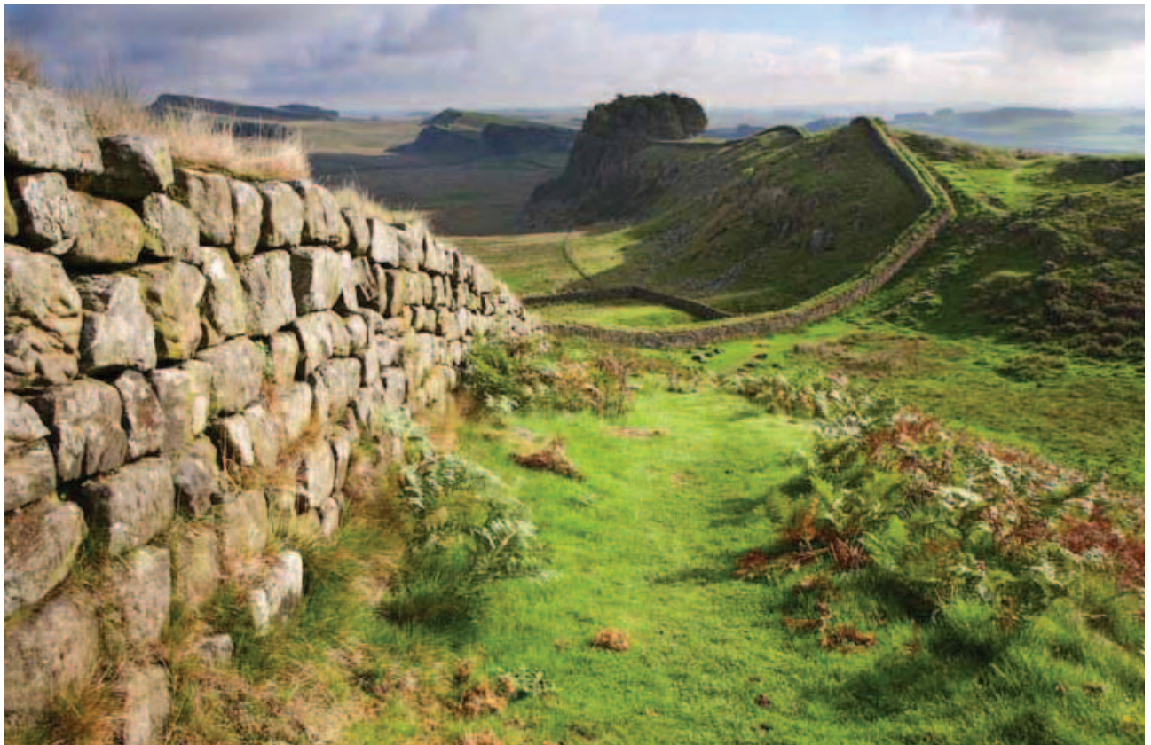
Hadrian's Wall