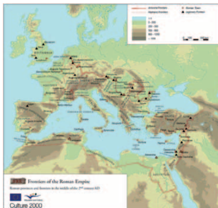
Map illustrating the boundary of the Roman Empire during the second century AD