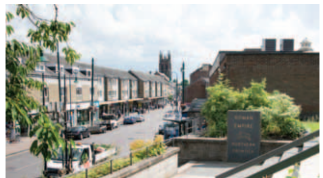
The Antonine Wall WHS can also contribute to projects focused on placemaking and civic pride

The evolving governance model will hopefully make it simpler to identify lead groups and organisations for specific projects, but the Steering Group and delivery groups will undoubtedly have to work more creatively in a difficult economic climate. While this Management Plan sets out specific Aims and Objectives for the Antonine Wall as an entire entity, successful delivery will rely on individual Partners and stakeholders transferring the relevant actions to their