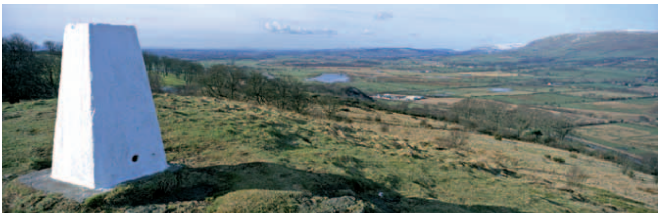
Kelvin Valley from the Antonine Wall