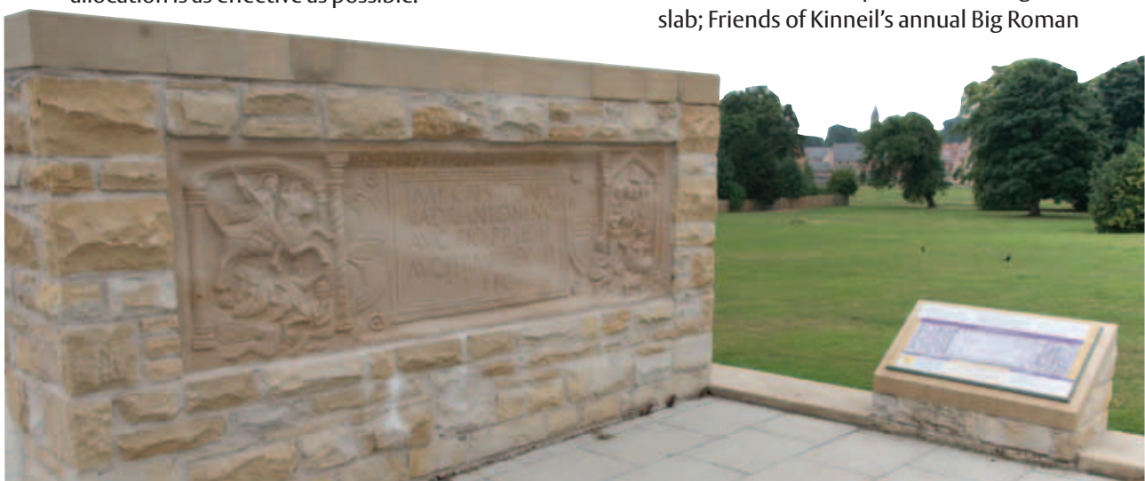
Bridgeness Slab reconstruction, Bo'ness