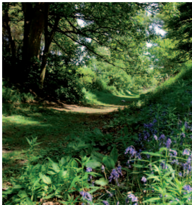
Ditch at Callendar Park, Falkirk

Implement and monitor measures to improve sustainability and energy efficiency in relation to Site management