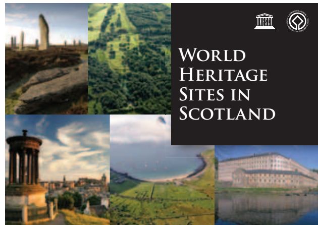
The Antonine Wall is one of five Scottish World Heritage Sites

To develop closer links with other Scottish World Heritage Sites