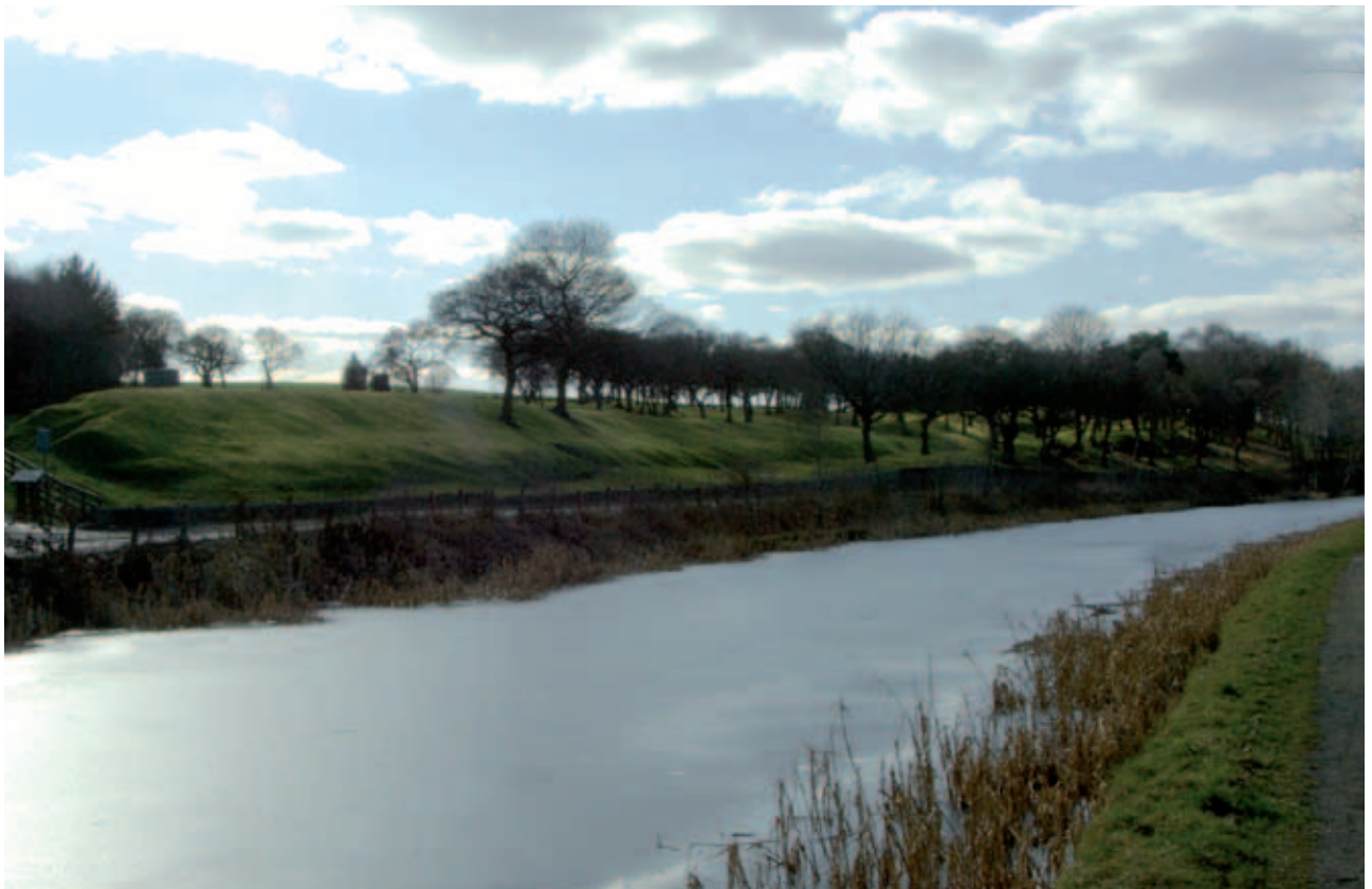
The Forth and Clyde Canal running alongside the Antonine Wall at Seabegs

Visitors themselves are, of course, important stakeholders. These can range from day trippers, dog walkers and long distance hikers to organised bus tours and special interest groups. While it is more difficult to engage such stakeholders in the development and delivery of specific objectives, they can, nonetheless, be consulted on specific site-based projects. Local and national transport operators provide the key facilities for visitors to reach many of the individual sites and