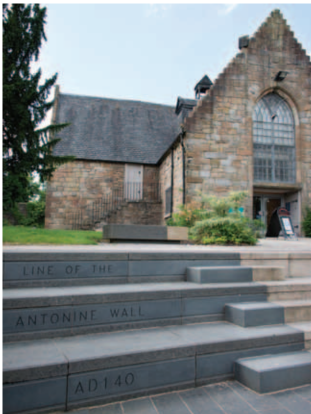
Old Kirk Museum, Kirkintilloch

East Dunbartonshire Council is part landowner of the Antonine Wall (2.2 km/17 ha, including Kirkintilloch Fort and New Kilpatrick Cemetery) with responsibility for the East Dunbartonshire Leisure and Culture Trust, an arms-length Trust whose remit includes the management of Auld Kirk Museum in Kirkintilloch. The Museum, situated next to the line of the Wall in the neighbouring Peel Park, has a small Roman display and runs outreach events for schools and the community. The Council is responsible for a wide range of services which are relevant to the management of the Antonine Wall. These include planning, economic development, tourism, roads and education. Archaeological services are provided to the Council by Rathmell Archaeology.