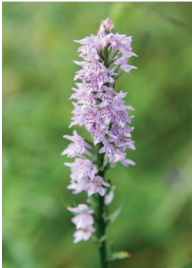
Common spotted orchid, Bar Hill

Identify areas of the Site at risk from climate change and integrate monitoring, mitigation and adaptation measures