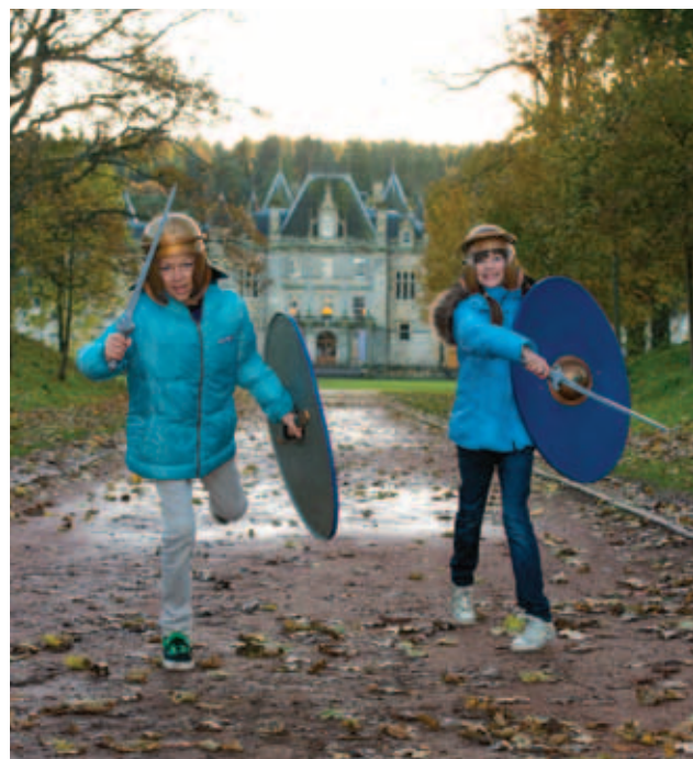
A popular education programme runs at Callendar Park

To develop and implement an education strategy for the Antonine Wall WHS