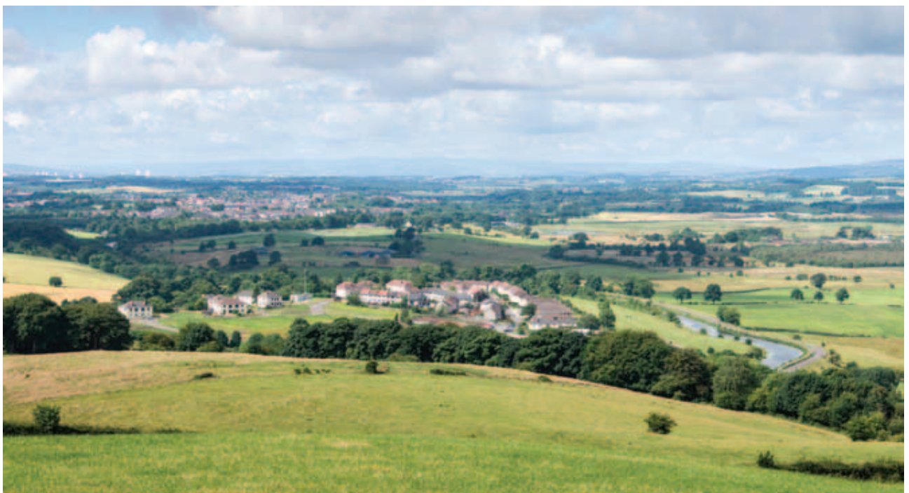
The Antonine Wall’s location in central Scotland means that both residential and industrial development must be carefully managed to protect the WHS and its setting