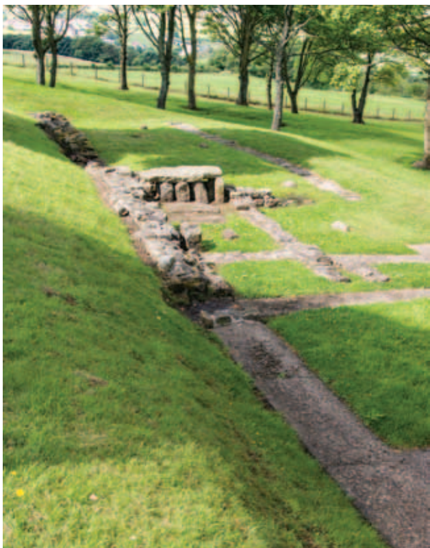
Bar Hill Fort, Bath House

means is that the range of values a property displays must be considered to go beyond national borders and has significance for everyone in the world now, and in the future. A Site is deemed to have Outstanding Universal Value if it can be shown to satisfy at least one of the ten criteria for assessment as set out in Section 77 of the Operational Guidelines.