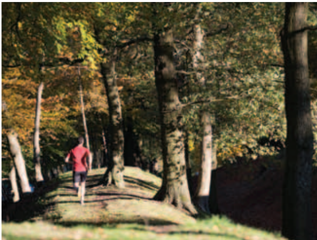
The Antonine Wall is used by many local 'healthy living' schemes

monuments along the Antonine Wall WHS but, to date, have not been widely involved in the delivery of Management Plan objectives. Visit Scotland is currently represented on the Access and Interpretation group for national tourism input, but there are also individual service providers in the hospitality and tourism sectors who have a significant role to play in the wider success of the Management Plan at a more local level. These can range from B&B's, hotels and restaurants, to local tour guiding companies, craftspeople and leisure activity providers across central Scotland.