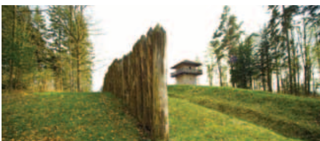
Raetian Limes