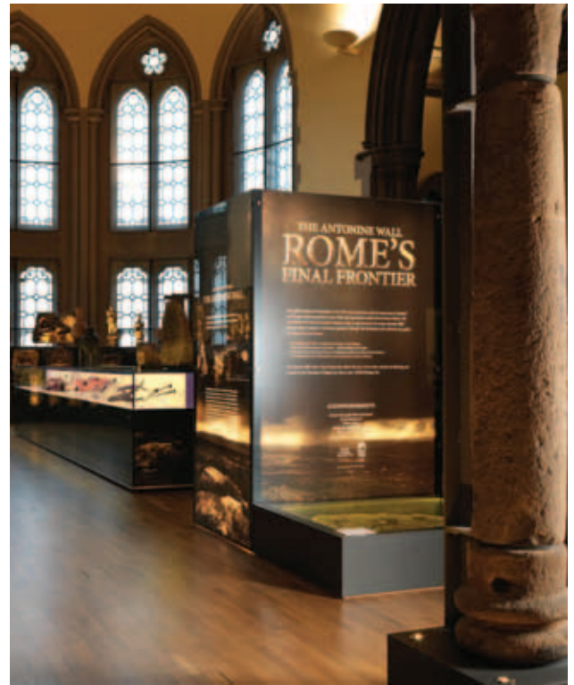
Antonine Wall Gallery, © Hunterian Museum