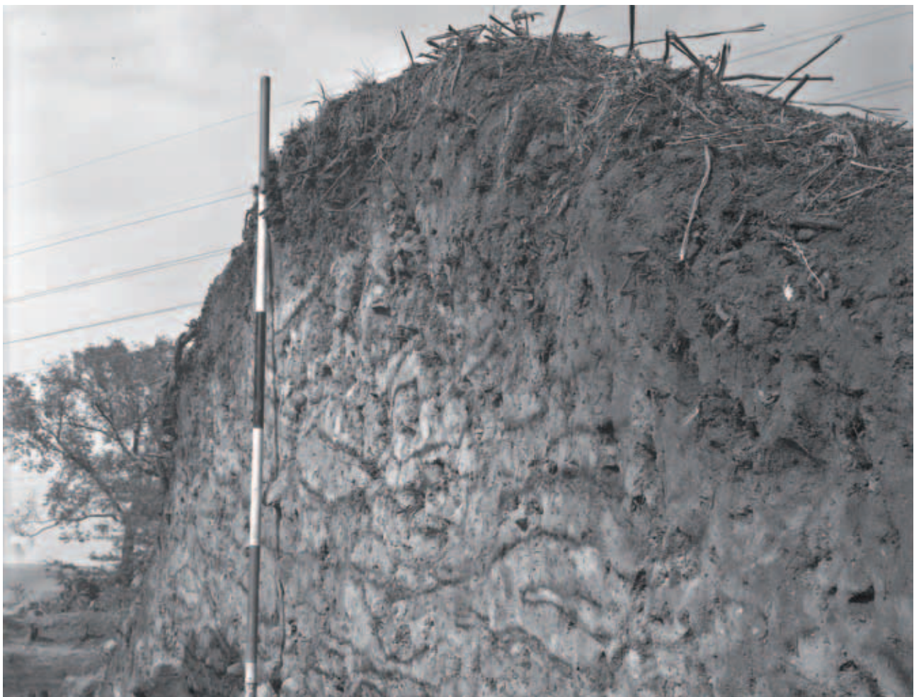
Section through Rough Castle