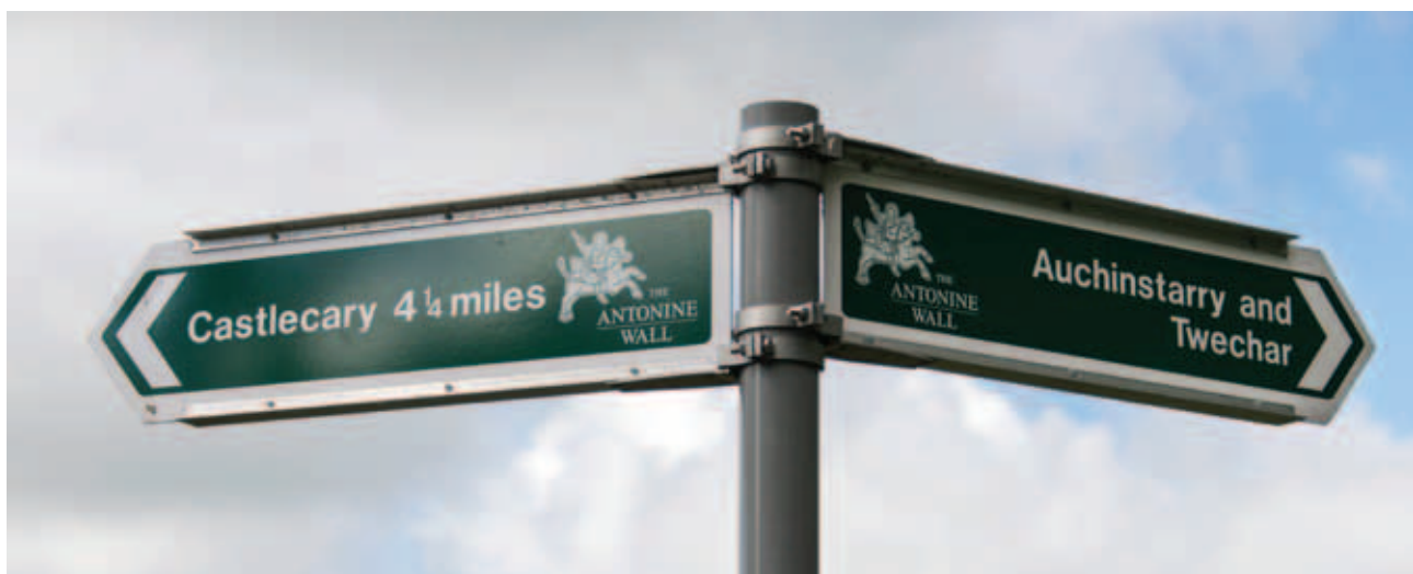
Antonine Wall branding on new signage