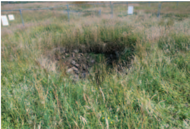
Mining collapse, Castlecary

There is a range of risks (physical, intellectual, organisational) that affects the Antonine Wall WHS. Physical risks include: threats to the fabric of the earthwork monument, particularly from erosion; changes to (mainly beneficial) traditional farming practices; potential impacts on setting from nearby development; and issues around managing visitor access to the WHS. Recent physical issues affecting the Antonine Wall include old mining collapse in the North Lanarkshire area, issues of poaching by cattle on pathways on the line of the WHS, and deep ploughing without consent of a section of bank and ditch. To date, there is still no agreed partnership approach to condition survey and monitoring, and the development of such a framework will be important in the period of this new Management Plan.