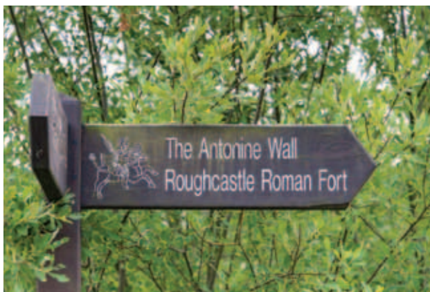
New signposting erected by Falkirk Council Rangers

In West Dunbartonshire, approaches have focused on improving the visibility of the Antonine Wall – careful land management and presentation regimes such as the mowing regime at Duntocher to pick out the line of the ramparts of fort and fortlet have been used alongside plaques to mark the Wall line in urban areas. In Bridgeness, in a project run by Falkirk Council and Bo'ness community council, a scanned stone replica of the distance slab has been created, and was erected in 2012, offering a focal point for visitors at the eastern end of the Antonine Wall. Other initiatives in Falkirk include signposting by the Council rangers from the Falkirk Wheel to Rough Castle, the delivery of an annual events programme in Bo'ness for Big Roman Week, and the inclusion of the Mumrills fort site in the planning for the new Helix development.