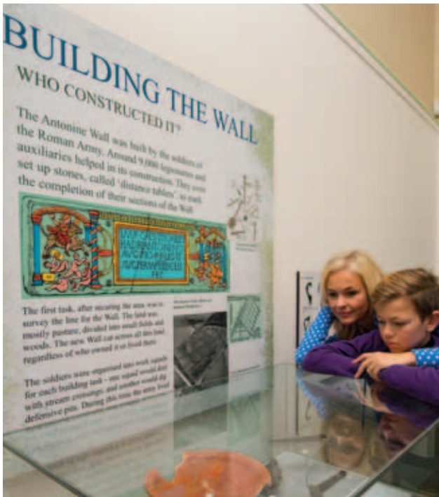
Museum collections play an important role in interpreting the Antonine Wall