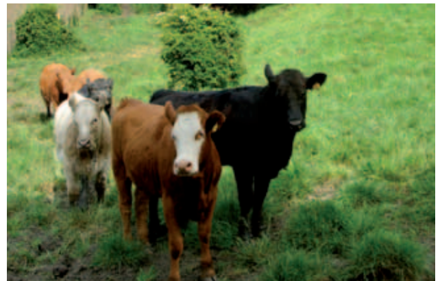
Cattle poaching can damage the site

Capacity Building to ensure that knowledge and understanding of the OUV of the World Heritage Site remains current amongst decision makers risk. Thus international co-operation and management of the sections of the FREWHS in line with best practice will be essential