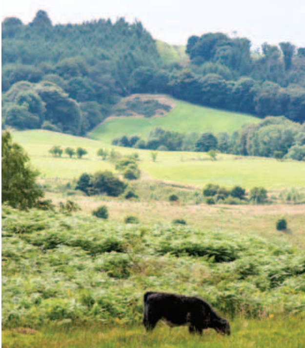
Forestry Commission cattle on Croy Hill, with Bar Hill in the background

During the consultation process to develop this Management Plan, several recommendations and requests were made for inclusion in the Plan that could not be accommodated within this five-year Plan period. This may be because of financial constraints, because the infrastructure required to deliver them is not yet developed, or because other priorities are more urgently required and thus assume precedence in developing the site.