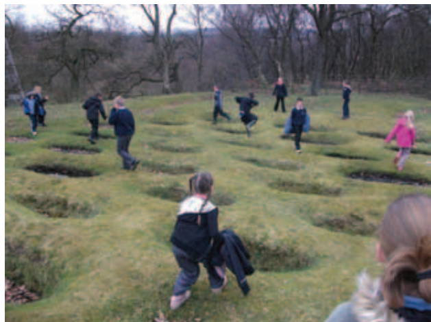
Easter Carmuir Primary visiting the Antonine Wall