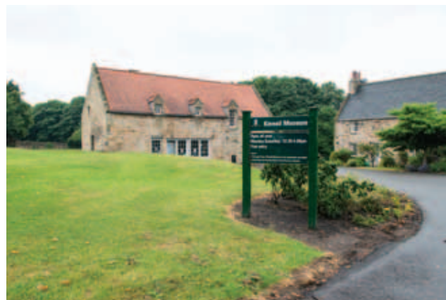
Kinneil Museum, Bo'ness

In Glasgow, the Hunterian Museum's Antonine Wall redisplay opened in September 2011 and other museums with Roman interpretation exist at Callendar