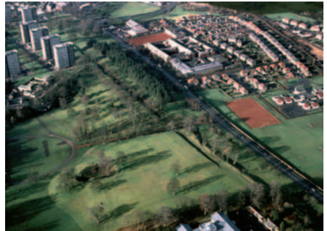
The Antonine Wall runs through many highly-populated areas, as here at Callendar Park, Falkirk

Many schools, universities and further education organisations use, or could use, the Antonine Wall WHS as part of their learning programmes. Representatives from several Scottish universities currently sit on the Research Group as do representatives from specialist bodies such as the Society of Antiquaries of Scotland, the Scottish Archaeological Research Framework and Glasgow Archaeological Society.