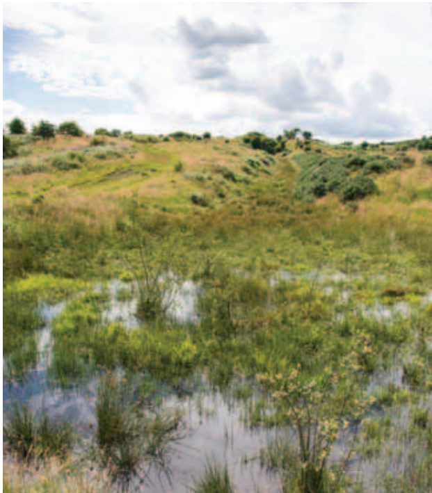
Important natural habitats exist along the length of the Antonine Wall

The development of agreed management plans, especially for sections of the Site in multiple ownership/management, that will seek to integrate cultural and natural heritage