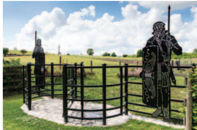
New access gate, Castlecary, erected by North Lanarkshire Council