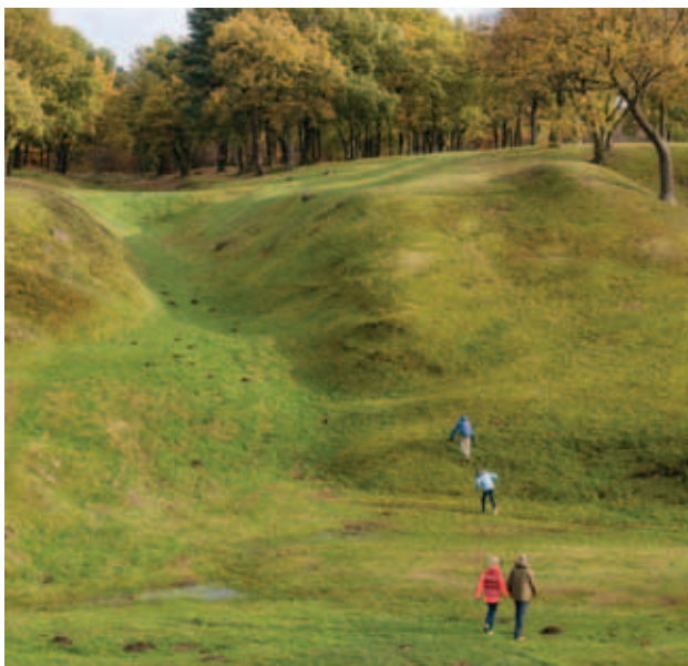
Rough Castle, Falkirk where an improved access path links the site with the Falkirk Wheel