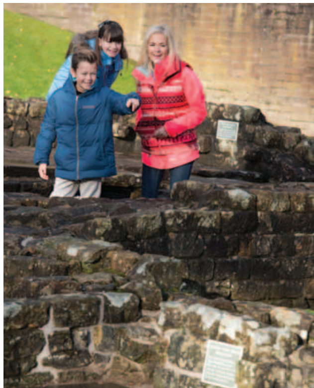
Exploring the Antonine Wall