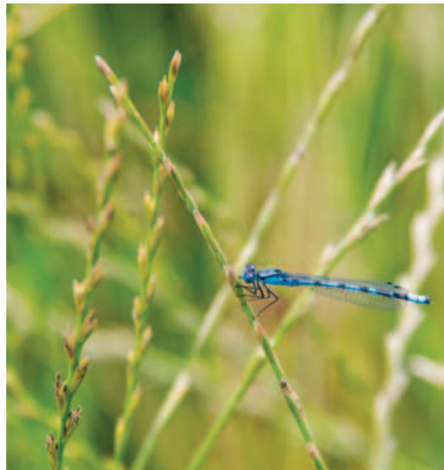
Common blue damselfly, Croy

Museums and heritage centres along the Antonine Wall curate, manage and present the archaeological and archival collections that relate to the Antonine Wall. They are also important contributors to the wider development of educational and interpretive resources. Many parts of the WHS support important natural habitats and have a significant contribution to make to biodiversity and geodiversity agendas. Heritage and environment bodies are keen to know how the cultural assets of the Antonine Wall WHS and its immediate surroundings are maintained; how access is provided to them; and how issues of climate, sustainability and ecosystems management are being considered. Key stakeholders in these fields include Forestry Commission Scotland, Scottish Natural Heritage, Central Scotland Green Network/Central Scotland Forest Trust, Scottish Canals, Archaeology Scotland, the Hunterian Museum, Scottish Geodiversity Forum, Scottish Wildlife Trust, SEPA and the Royal Society for the Protection of Birds.