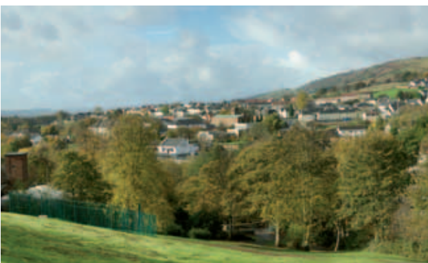
Golden Hill Park, Duntocher

West Dunbartonshire Council is responsible for a wide range of services which are relevant to the management of the Site. These include planning, economic development, tourism, heritage, roads, education and museums. The Council is also partial landowner of the Site (0.8 km 2 /4.8 ha) with responsibility for Golden Hill Park which is the site of Duntocher Fort and fortlet. Archaeology services are provided by West of Scotland Archaeology Service.