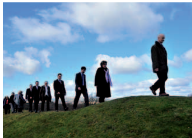
Ministerial visit to the Antonine Wall

There are a number of other public and private landowners, tenants and land managers who have a sizeable stake in the Antonine Wall WHS. Many of the issues facing the Site, including land management and rural issues, will be shared by them and it is vital that they have a say in decisions which affect their landholdings or properties.