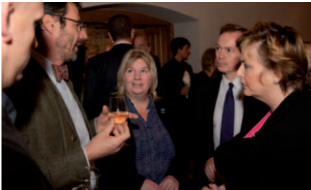
The Cabinet Secretary, Fiona Hyslop, with international partners from the Antonine Wall, Hadrian's Wall and the German Limes

To contribute to the development of management principles for the international community on the identification, recording, research, protection, conservation, management, presentation and understanding of the Roman frontier