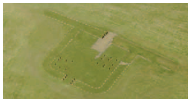
Fortlet at Kinneil, in Bo'ness, where community events take place annually

To encourage CPD opportunities for education staff, to build capacity in teaching about the Antonine Wall WHS