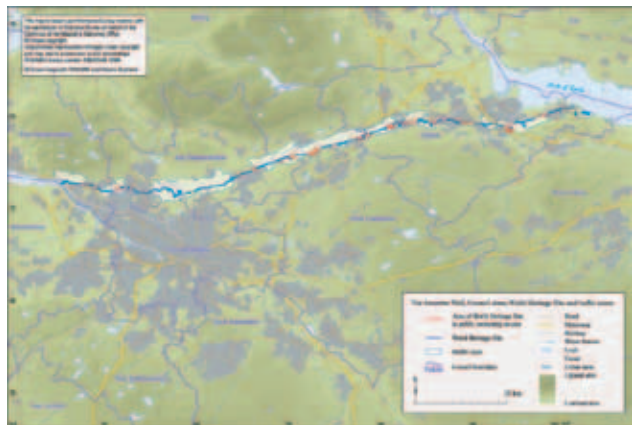
The Antonine Wall and its Buffer Zone

The boundary of the Antonine Wall WHS and its Buffer Zone will be kept under review to ensure that its outstanding universal significance is adequately protected