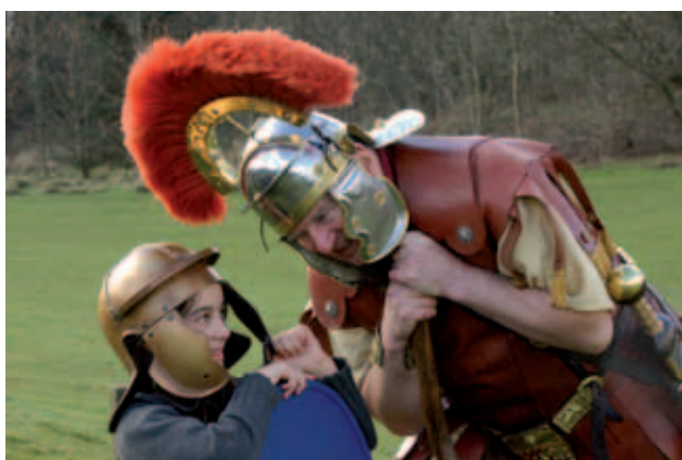
Meeting a Roman soldier