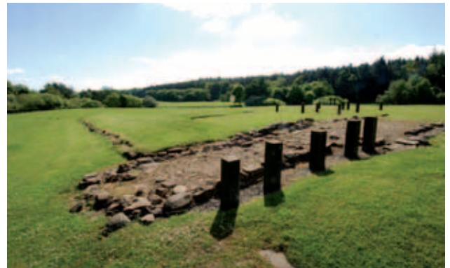
Kinneil Fortlet, Falkirk

Falkirk Council has responsibility for a wide range of services, related to the management of the WHS, which include planning, economic development, tourism, roads and education. The Council is also partial landowner of the Site (about 5.4 km/40 ha including Kinneil fortlet and a section at Polmont) and has responsibility for an arms-length Community Trust which provides archaeological advice to the Council and manages the Callendar House Museum and Kinneil Museum, both of which have Roman displays and run outreach events. The Trust also acts as advisor to the Council on collections management and heritage interpretation.