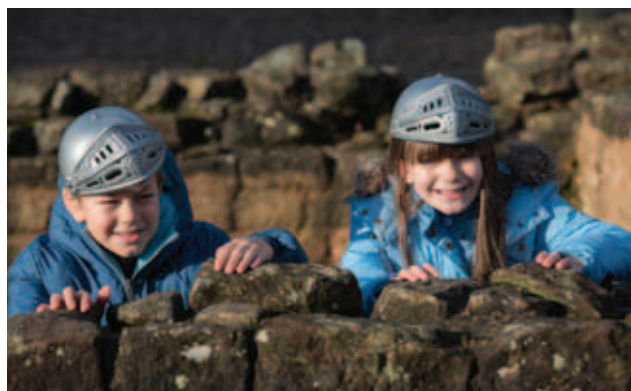
Getting into character at Bearsden Bath-house