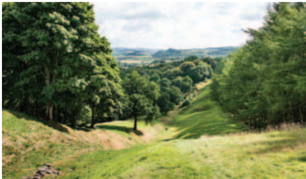
Forestry Commission woodland on Bar Hill, looking to Croy Hill

Integrate the Antonine Wall into Partners' and Stakeholders' emerging woodland management plans