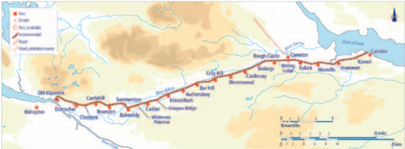
The line of the Antonine Wall across Scotland

bears testimony to the maximum extension of the power of the Roman Empire, by the consolidation of its frontiers in the north of the British Isles, in the middle of the second century AD. The property is a physical manifestation of change in Roman imperial foreign policy at the time. The Antonine Wall is one of the significant elements of the Roman Limes present in Europe, the Middle East and North Africa. It exhibits important interchanges of cultural values at the apogee of the Roman Empire. The Antonine Wall fully illustrates the effort of building the Limes on the frontiers of the Roman Empire. It embodies a high degree of expertise in the technical mastery of stone and turf defensive constructions, in the construction of a strategic system of forts and camps, and in the general military organisation of the Limes. The Antonine Wall is an outstanding example of the technological development of Roman military architecture and frontier defence.