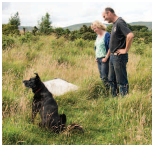
Visitors at Croy Hill

An Interpretation Plan and Access Strategy was written during the period of the first Management Plan, with part of the work including an audience survey to determine public perceptions of the wall and to gather evidence of needs and expectations from visitors. It highlighted a suite of works along the length of the Wall that should be undertaken to optimise visitors' experiences, enhance enjoyment and understanding for both local people and other visitors, and extend overall appreciation of the universal significance and status of the Antonine Wall WHS and its setting. As part of the process a new 'brand identity' was created for the Wall with a logo and guidance for all Partners on the standardised production of interpretive and promotional materials. Following a public consultation exercise the plan has been adopted by all Partners and they are now drawing up action plans to deliver key elements of these proposals.