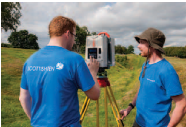
The Scottish Ten project surveying Rough Castle

Increasingly, digital technology can offer an improved visitor experience at cultural heritage attractions both on and off site. Internationally, the German Limes have produced an app for visitors, and Hadrian's Wall has dedicated online resources that encompass a wide range of visitor needs. In 2008 websites were created for both the FREWHS and the Antonine Wall, but due to staffing difficulties, have not been actively updated or developed for some time. Each of the Scottish Partners has a webpage or multiple pages on their own organisation's website, but there is little consistency between them on content or links from one to the other.