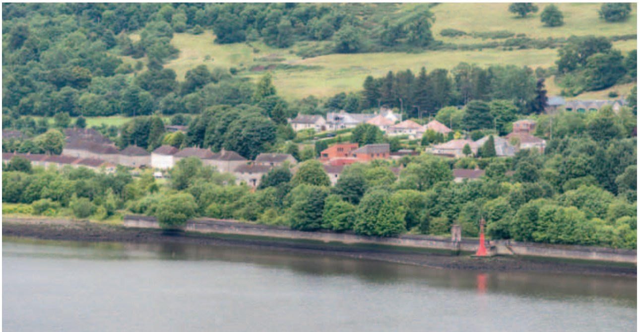
Olk Kilpatrick, site of the most westerly Roman fort on the Antonine Wall

It is hoped that by the end of this five-year management Plan period, the Antonine Wall will be more strongly positioned as a national and international visitor destination, that management and monitoring approaches will be more closely aligned internationally and, crucially, that people should continue to have the opportunity to actively contribute to the development of the World Heritage Site.