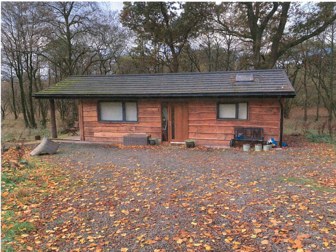
PHOTOGRAPH 1. The unauthorised erection of a single storey building (cabin) – “Bluebell Lodge”