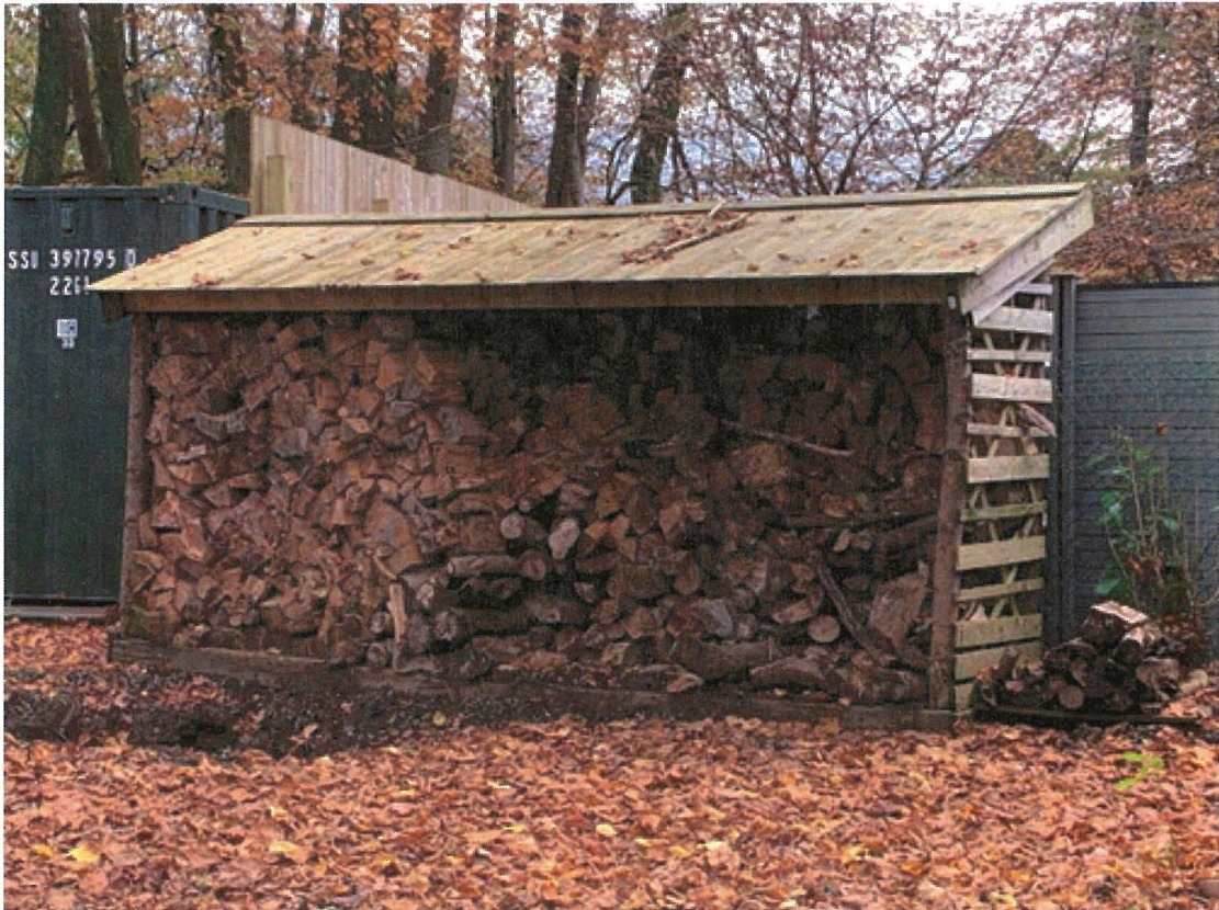
PHOTOGRAPH 2. The unauthorised erection of a log store structure.