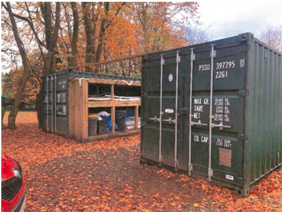
PHOTOGRAPH 3. The unauthorised siting of two freight storage containers sandwiching a timber storage structure which is being used for the storage of various building materials.