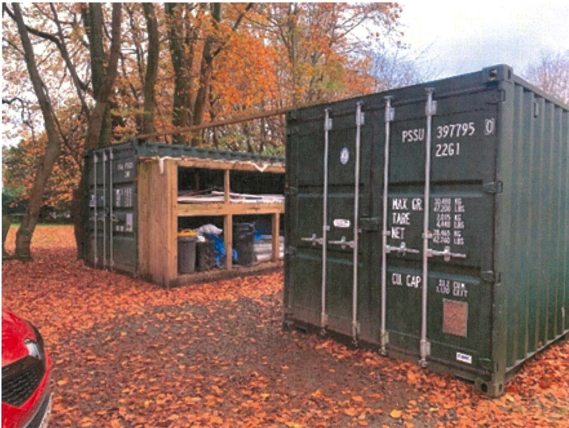
PHOTOGRAPH 3. The unauthorised siting of two freight storage containers sandwiching a timber storage structure which is being used for the storage of various building materials.