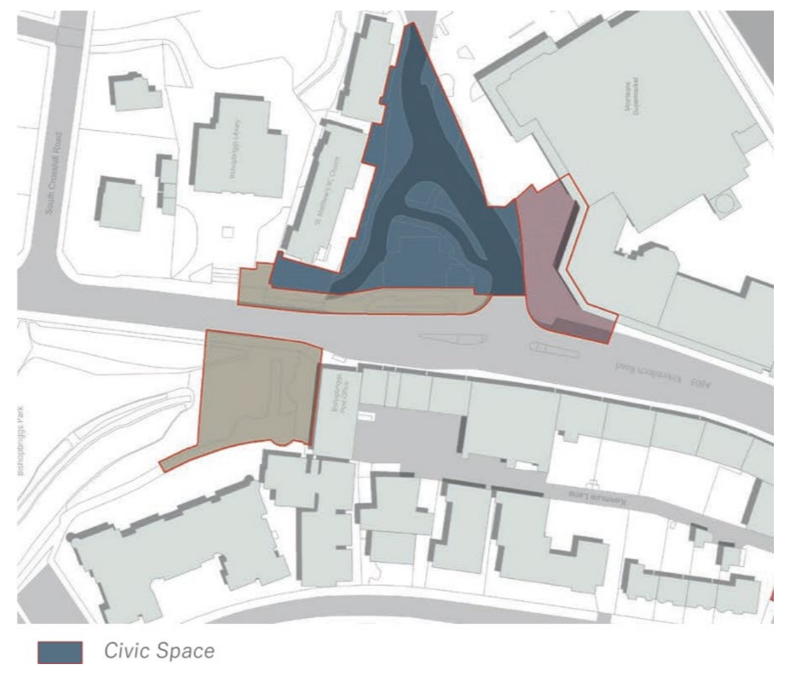
Figure 2: Location of Civic Space in Bishopbriggs Town Centre